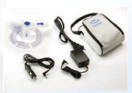
Reusable nebulizer with tubing, DC car adapter, AC power cord and carrying case all come standard with Stratos Portable Plus unit.